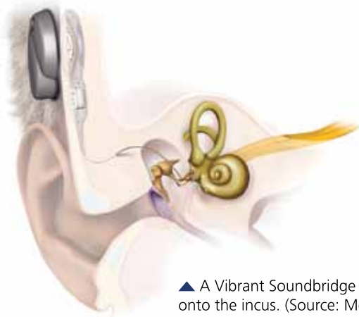
▲ A Vibrant Soundbridge system applied onto the incus.