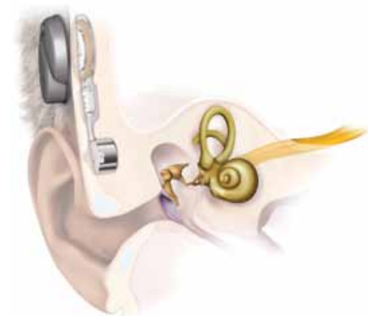
▲ The internal component of a Bonebridge embedded under the skin and the external speech processor attached to the skin via a magnet.

This allows the opposite good ear to hear sounds originating from the deafened side. This is called 'pseudo-binaural' hearing where patients no longer miss sounds coming from their deaf ear. However, all hearing goes through the only normal hearing ear.