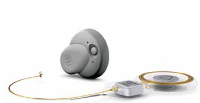
▲ The components of a Vibrant Soundbridge Active Middle Ear Implant.

These devices are indicated in two situations. The first situation is where there is significant sensorineural hearing loss, usually affecting the higher frequencies more than the lower frequencies. These patients usually do not achieve sufficient benefit from conventional hearing aids as the amplification of the higher frequencies in a hearing aid is usually limited. Active middle ear implants are able to give greater increase in high frequency hearing than conventional hearing aids.