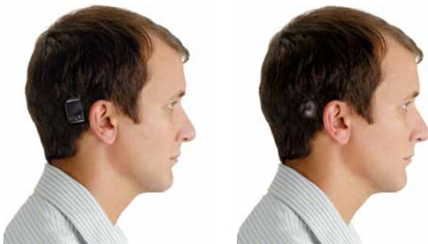
▲ A patient with a Bone Anchored Hearing Aid (BAHA) with a speech processor attached (left) and without a speech processor attached, showing the exposed titanium screw (right).

Active middle ear implants are another entirely different class of surgical hearing implants. Examples include the Vibrant Soundbridge® system and the Carina® system. They comprise an internal vibrating prosthesis that directly vibrates the middle ear ossicles or the round window. This results in greater vibration energy being transmitted to the inner ear, leading to better hearing.